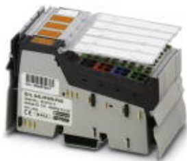
1-channel DALI master; with integrated DALI power supply unit; reliable electrical isolation

Please be informed that the data shown in this PDF Document is generated from our Online Catalog. Please find the complete data in the user's documentation. Our General Terms of Use for Downloads are valid ( http://phoenixcontact.com/download )