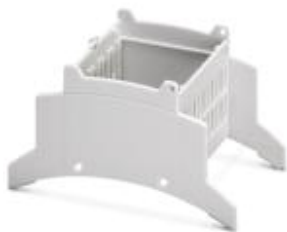
Installation component housing, Upper part, Color: light gray, Width: 53.6 mm, Constructional height: 62.2 mm

Please be informed that the data shown in this PDF Document is generated from our Online Catalog. Please find the complete data in the user's documentation. Our General Terms of Use for Downloads are valid ( http://phoenixcontact.com/download )