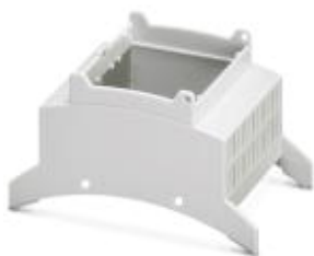
Installation component housing, Upper part, Color: light gray, Width: 53.6 mm, Constructional height: 62.2 mm

Please be informed that the data shown in this PDF Document is generated from our Online Catalog. Please find the complete data in the user's documentation. Our General Terms of Use for Downloads are valid ( http://phoenixcontact.com/download )