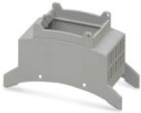
Installation component housing, Upper part, Color: light gray, Width: 35.6 mm, Constructional height: 62.2 mm

Please be informed that the data shown in this PDF Document is generated from our Online Catalog. Please find the complete data in the user's documentation. Our General Terms of Use for Downloads are valid ( http://phoenixcontact.com/download )