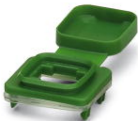
IP54 protection with color marking for SFN switch and angled patch connector, green

Please be informed that the data shown in this PDF Document is generated from our Online Catalog. Please find the complete data in the user's documentation. Our General Terms of Use for Downloads are valid ( http://phoenixcontact.com/download )