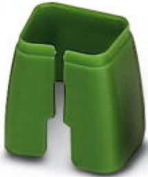
Color marking for patch cable, green

Please be informed that the data shown in this PDF Document is generated from our Online Catalog. Please find the complete data in the user's documentation. Our General Terms of Use for Downloads are valid ( http://phoenixcontact.com/download )