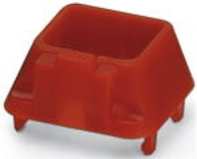
Security frame for SFN switch and patch fields, red

Please be informed that the data shown in this PDF Document is generated from our Online Catalog. Please find the complete data in the user's documentation. Our General Terms of Use for Downloads are valid ( http://phoenixcontact.com/download )