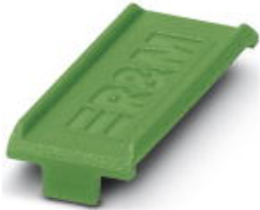
Color marking for FL PATCH GUARD, green

Please be informed that the data shown in this PDF Document is generated from our Online Catalog. Please find the complete data in the user's documentation. Our General Terms of Use for Downloads are valid ( http://phoenixcontact.com/download )