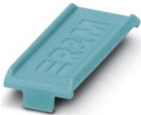
Color marking for FL PATCH GUARD, turquoise

Please be informed that the data shown in this PDF Document is generated from our Online Catalog. Please find the complete data in the user's documentation. Our General Terms of Use for Downloads are valid ( http://phoenixcontact.com/download )