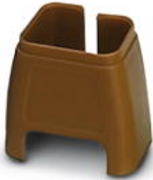
Color marking for patch cable, brown

Please be informed that the data shown in this PDF Document is generated from our Online Catalog. Please find the complete data in the user's documentation. Our General Terms of Use for Downloads are valid ( http://phoenixcontact.com/download )