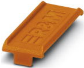
Color marking for FL PATCH GUARD, orange

Please be informed that the data shown in this PDF Document is generated from our Online Catalog. Please find the complete data in the user's documentation. Our General Terms of Use for Downloads are valid ( http://phoenixcontact.com/download )