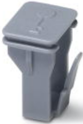
Locking element and key for security frame

Please be informed that the data shown in this PDF Document is generated from our Online Catalog. Please find the complete data in the user's documentation. Our General Terms of Use for Downloads are valid ( http://phoenixcontact.com/download )