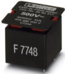
Power modules, pluggable, for EMD-FL-..., supply voltage: 425...550 V AC

Please be informed that the data shown in this PDF Document is generated from our Online Catalog. Please find the complete data in the user's documentation. Our General Terms of Use for Downloads are valid ( http://phoenixcontact.com/download )