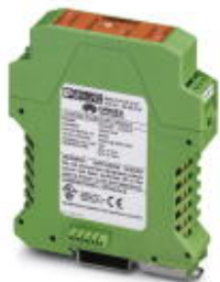
Digital extension module with 2 digital outputs for output of pulses and frequencies

Please be informed that the data shown in this PDF Document is generated from our Online Catalog. Please find the complete data in the user's documentation. Our General Terms of Use for Downloads are valid ( http://phoenixcontact.com/download )