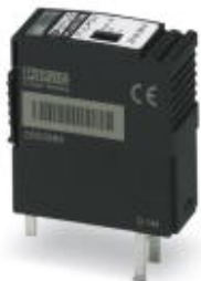
Replacement plug for PLUGTRAB PT-IQ controller for power supply

Please be informed that the data shown in this PDF Document is generated from our Online Catalog. Please find the complete data in the user's documentation. Our General Terms of Use for Downloads are valid ( http://phoenixcontact.com/download )