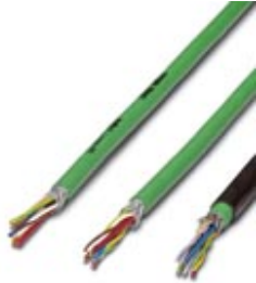
INTERBUS hybrid cable for the extended installation remote bus

Please be informed that the data shown in this PDF Document is generated from our Online Catalog. Please find the complete data in the user's documentation. Our General Terms of Use for Downloads are valid ( http://phoenixcontact.com/download )