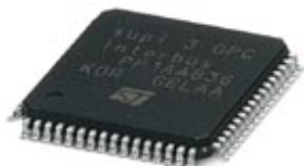
Slave protocol chip, for INTERBUS

Please be informed that the data shown in this PDF Document is generated from our Online Catalog. Please find the complete data in the user's documentation. Our General Terms of Use for Downloads are valid ( http://phoenixcontact.com/download )