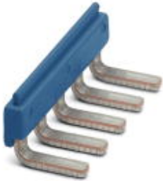
Insertion bridge, Number of positions: 5, Color: blue

Please be informed that the data shown in this PDF Document is generated from our Online Catalog. Please find the complete data in the user's documentation. Our General Terms of Use for Downloads are valid ( http://phoenixcontact.com/download )