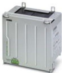
Power storage device, lead AGM, VRLA technology, 24 V DC, 12 Ah, tool-free battery replacement, automatic detection, and communication with QUINT UPS-IQ

Please be informed that the data shown in this PDF Document is generated from our Online Catalog. Please find the complete data in the user's documentation. Our General Terms of Use for Downloads are valid ( http://phoenixcontact.com/download )