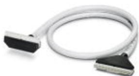
The figure shows the 50-pos. product version

Assembled round cable with two molded 40-pos. socket strips (1:1 connection). The cable has a 90° punched on connector and a 180° punched on connector, cable length: 2 m