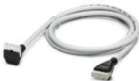
The figure shows the 14-pos. product version

Assembled round cable with two molded 20-pos. socket strips (1:1 connection). The cable has a 90° punched on connector and a 180° punched on connector, cable length: 0.5 m