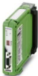
PROFIBUS DP interface/repeater module

Please be informed that the data shown in this PDF Document is generated from our Online Catalog. Please find the complete data in the user's documentation. Our General Terms of Use for Downloads are valid ( http://phoenixcontact.com/download )