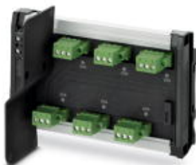
Device coupler for Foundation Fieldbus with terminal connections for six spurs connected to fieldbus end devices

Please be informed that the data shown in this PDF Document is generated from our Online Catalog. Please find the complete data in the user's documentation. Our General Terms of Use for Downloads are valid ( http://phoenixcontact.com/download )