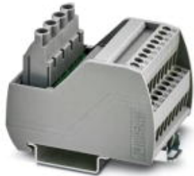
VARIOFACE module, with two equipotential busbars (P1, P2) for potential distribution, for mounting on NS 35 rails. Module width: 50.0 mm

Please be informed that the data shown in this PDF Document is generated from our Online Catalog. Please find the complete data in the user's documentation. Our General Terms of Use for Downloads are valid ( http://phoenixcontact.com/download )