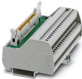
VARIOFACE interface module for Siemens SIMATIC® S7-300, with SIMATIC®-specific labeling (1 - 40), with screw connection, module width: 106.1 mm

Please be informed that the data shown in this PDF Document is generated from our Online Catalog. Please find the complete data in the user's documentation. Our General Terms of Use for Downloads are valid ( http://phoenixcontact.com/download )