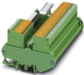
VARIOFACE module for ABB S800 I/O, with knife disconnect terminal blocks and specific marking (+1, B1, C1, +2, B2, C2, ... +8, B8, C8)

Please be informed that the data shown in this PDF Document is generated from our Online Catalog. Please find the complete data in the user's documentation. Our General Terms of Use for Downloads are valid ( http://phoenixcontact.com/download )