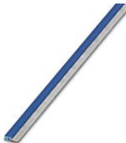
Jumper for PCO power connector in ME-MAX housing, color: blue (similar to RAL 5015)

Please be informed that the data shown in this PDF Document is generated from our Online Catalog. Please find the complete data in the user's documentation. Our General Terms of Use for Downloads are valid ( http://phoenixcontact.com/download )