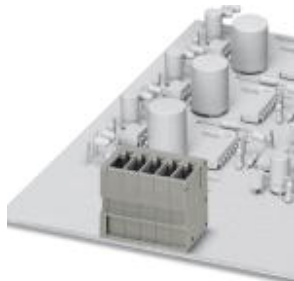
ST-COMBI receptacle, plug-in direction vertical to the PCB, pitch: 5.2 mm, no. of positions: 5

Please be informed that the data shown in this PDF Document is generated from our Online Catalog. Please find the complete data in the user's documentation. Our General Terms of Use for Downloads are valid ( http://phoenixcontact.com/download )