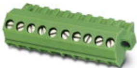
The figure shows a 10-position version of the product

Plug component, Nominal current: 12 A, Rated voltage (III/2): 320 V, Number of positions: 2, Pitch: 5.08 mm, Connection method: Screw connection with tension sleeve, Color: green, Contact surface: Tin