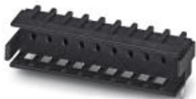
The figure shows a 9-pos. version of the product

Header, Nominal current: 3 A, Rated voltage (III/2): 250 V, Number of positions: 16, Pitch: 3.5 mm, Color: black, Contact surface: Tin, Mounting: THR soldering, The touch-protected basic strip, serves to accommodate the FK-MPT 0,5 PCB terminal block.