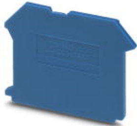
End cover, Length: 50.5 mm, Width: 2 mm, Height: 47 mm, Color: blue

Please be informed that the data shown in this PDF Document is generated from our Online Catalog. Please find the complete data in the user's documentation. Our General Terms of Use for Downloads are valid ( http://phoenixcontact.com/download )