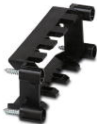
Sleeve frame, without PE, for contact insert modules, type 4, number of insert modules 5

Please be informed that the data shown in this PDF Document is generated from our Online Catalog. Please find the complete data in the user's documentation. Our General Terms of Use for Downloads are valid ( http://phoenixcontact.com/download )