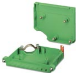
Cable housing, Pitch: 0 mm, Number of positions: 9, Dimension a: 70.98 mm, Color: green

Please be informed that the data shown in this PDF Document is generated from our Online Catalog. Please find the complete data in the user's documentation. Our General Terms of Use for Downloads are valid ( http://phoenixcontact.com/download )