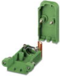
Cable housing, Pitch: 0 mm, Number of positions: 5, Dimension a: 39.9 mm, Color: green

Please be informed that the data shown in this PDF Document is generated from our Online Catalog. Please find the complete data in the user's documentation. Our General Terms of Use for Downloads are valid ( http://phoenixcontact.com/download )