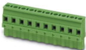
The figure shows a 10-position version of the product

Plug component, Nominal current: 12 A, Rated voltage (III/2): 630 V, Number of positions: 8, Pitch: 7.62 mm, Connection method: Screw connection with tension sleeve, Color: green, Contact surface: Tin