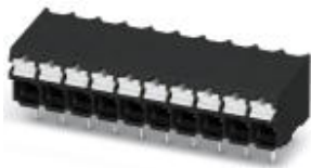
The illustration shows the 10-position version