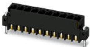
The illustration shows the 10-position version