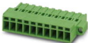
The illustration shows an 10-position version

Plug component, Nominal current: 12 A, Rated voltage (III/2): 320 V, Number of positions: 3, Pitch: 5.08 mm, Connection method: Crimp connection, Color: green, Corresponding female crimp contacts with current [A] and conductor cross section range [mm 2 ] data: 10A/MSTBC-MT 0,5-1,0 (3190564); 10A/MSTBC-MT 0,5-1,0 BA (3190645); 12A/MSTBC-MT 1,5-2,5 (3190551); 12A/MSTBC-MT 1,5-2,5 BA (3190658). BA = Bandkontakte