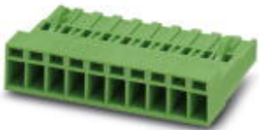
The illustration shows an 10-position version

Plug component, Nominal current: 12 A, Rated voltage (III/2): 320 V, Number of positions: 2, Pitch: 5.08 mm, Connection method: Crimp connection, Color: green, Corresponding female crimp contacts with current [A] and conductor cross section range [mm 2 ] data: 10A/MSTBC-MT 0,5-1,0 (3190564); 10A/MSTBC-MT 0,5-1,0 BA (3190645); 12A/MSTBC-MT 1,5-2,5 (3190551); 12A/MSTBC-MT 1,5-2,5 BA (3190658). BA = Bandkontakte