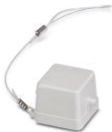
HEAVYCON protective cover, D7 design, for panel mounting bases, box mounting bases, and coupling housing with single locking latch and pin insert, with retaining cord, without seal, IP54, plastic

Please be informed that the data shown in this PDF Document is generated from our Online Catalog. Please find the complete data in the user's documentation. Our General Terms of Use for Downloads are valid ( http://phoenixcontact.com/download )