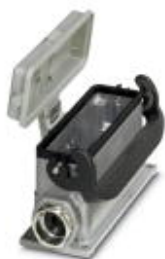
Box mounting base, with single locking latch, height 67 mm, with screw connection, 1x Pg21, with protective covers

Please be informed that the data shown in this PDF Document is generated from our Online Catalog. Please find the complete data in the user's documentation. Our General Terms of Use for Downloads are valid ( http://phoenixcontact.com/download )