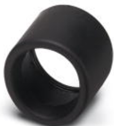
Seal, outside, to increase the protection type, size Pg21

Please be informed that the data shown in this PDF Document is generated from our Online Catalog. Please find the complete data in the user's documentation. Our General Terms of Use for Downloads are valid ( http://phoenixcontact.com/download )