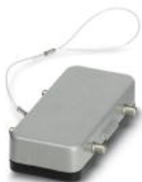
HEAVYCON protective cover, type B16, for sleeve housing with double locking latch, with retaining cord, IP65, ALU

Please be informed that the data shown in this PDF Document is generated from our Online Catalog. Please find the complete data in the user's documentation. Our General Terms of Use for Downloads are valid ( http://phoenixcontact.com/download )