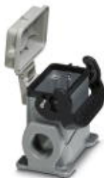
HEAVYCON box mounting base B10, with single locking latch, height 74 mm, with support 1xM25, with cover

Please be informed that the data shown in this PDF Document is generated from our Online Catalog. Please find the complete data in the user's documentation. Our General Terms of Use for Downloads are valid ( http://phoenixcontact.com/download )