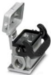
HEAVYCON box mounting base B10, with single locking latch, height 52 mm, with supports 1xM20, with cover

Please be informed that the data shown in this PDF Document is generated from our Online Catalog. Please find the complete data in the user's documentation. Our General Terms of Use for Downloads are valid ( http://phoenixcontact.com/download )