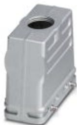
HEAVYCON sleeve housing B16, for double locking latch, height 76 mm, with thread M40, straight cable outlet, EMC version

Please be informed that the data shown in this PDF Document is generated from our Online Catalog. Please find the complete data in the user's documentation. Our General Terms of Use for Downloads are valid ( http://phoenixcontact.com/download )