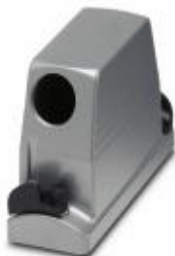
HEAVYCON ADVANCE standard powder-coated sleeve housing B16, with bayonet locking, height 100 mm, with 1xM40 thread, lateral cable outlet

Please be informed that the data shown in this PDF Document is generated from our Online Catalog. Please find the complete data in the user's documentation. Our General Terms of Use for Downloads are valid ( http://phoenixcontact.com/download )