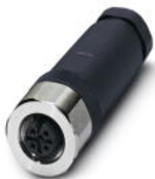
Sensor/actuator connector, female, straight, 5-pos., M12, screw connection, high-grade steel knurl, cable screw connection Pg9

Please be informed that the data shown in this PDF Document is generated from our Online Catalog. Please find the complete data in the user's documentation. Our General Terms of Use for Downloads are valid ( http://phoenixcontact.com/download )