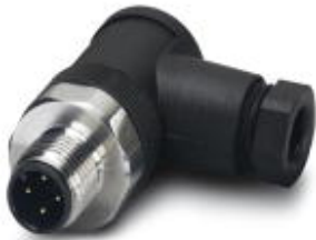
Sensor/actuator connector, male, angled, 4-pos., M12, screw connection, high-grade steel knurl, cable screw connection Pg7

Please be informed that the data shown in this PDF Document is generated from our Online Catalog. Please find the complete data in the user's documentation. Our General Terms of Use for Downloads are valid ( http://phoenixcontact.com/download )