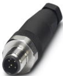
Sensor/actuator connector, male, straight, 5-pos., M12, screw connection, high-grade steel knurl, cable screw connection Pg7

Please be informed that the data shown in this PDF Document is generated from our Online Catalog. Please find the complete data in the user's documentation. Our General Terms of Use for Downloads are valid ( http://phoenixcontact.com/download )